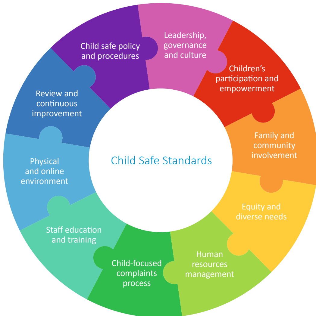
Figure 6.1 – The Child Safe Standards

Consistent with Article 3, all institutions concerned with children should act with the best interests of the child as a primary consideration. 40 To achieve this, we believe all such institutions should implement the Child Safe Standards identified by the Royal Commission (see Figure 6.1).